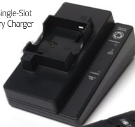
110V Single-Slot Battery Charger