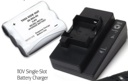
110V Single-Slot Battery Charger