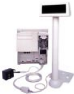
The DM-D805 pole display kit connects directly to a host system.

The DM-D805 pole display kit delivers the outstanding quality and reliability you've come to expect from the leader in POS technology. Available in Epson Cool White and Epson Dark Gray, it is a cost-effective solution for your customer display needs.