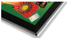
C2167PW Flat Front Surface