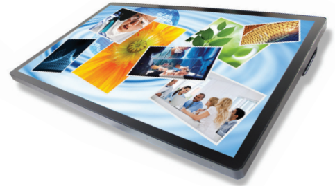
3M Multi-Touch Display C2167PW