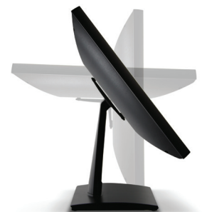
90-degrees of Adjustment