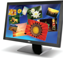
3M Multi-Touch Display M2167PW 3M Multi-Touch Display M2467PW