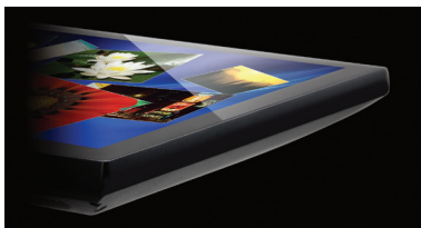
Flat Front Surface (Virtual Bezel)