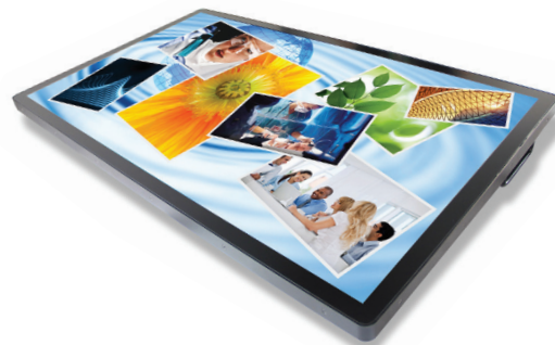
Multi-Touch Chassis Displays

3M combines its industry-leading multi-touch technology that delivers an ultra-fast, accurate, and precise multi-touch response, with a high-definition, wide viewing angle LCD, to create a multi-touch chassis for your next generation interactive application. The rugged all steel frame and a highly durable glass front surface provide the durability needed for demanding public use environment.