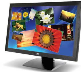
3M Multi-Touch Display M2767PW