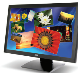
Multi-Touch Desktop Displays

3M™ takes interactive display technology to the next level by combining uncompromising multi-touch performance, brilliant high-definition graphics, wide viewing angles and elegant product design into a fully-integrated, easy-to-use, plug-and-play multi-touch desktop device.