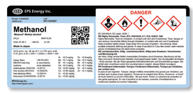
The C3500 using Epson pigment inks is BS5609 certified for GHS labels 2

Color-coded labels enable fast, accurate product identification.